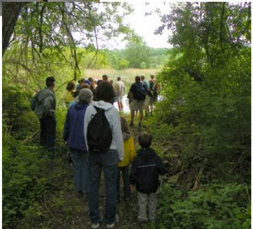
The hikers stopped at one of the beaver pond observation clearings along the Auburn Trail.