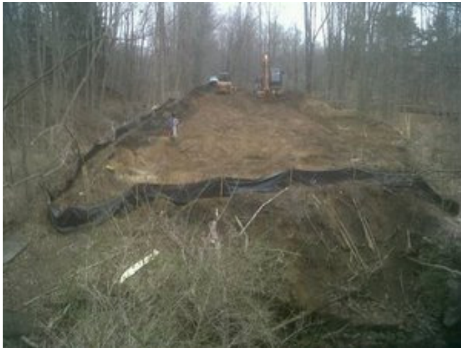
Excavation of the southeast side of Irondequoit Creek.

The construction phase of this project is on schedule, despite the wet Spring weather that we experienced. Below are some pictures showing the work that is being done to replace the old stone culvert with a new steel bridge. The bridge is being constructed in Tuscaloosa, Alabama and will be delivered and installed in July. Victor Parks and Recreation will build and install the railings. This phase of the project is expected to be completed by the end of August.