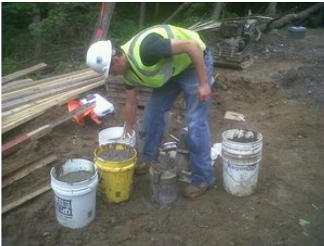
Testing samples of the concrete.