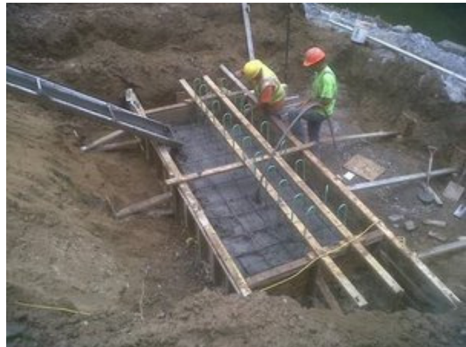
Pouring the concrete for the foundation.