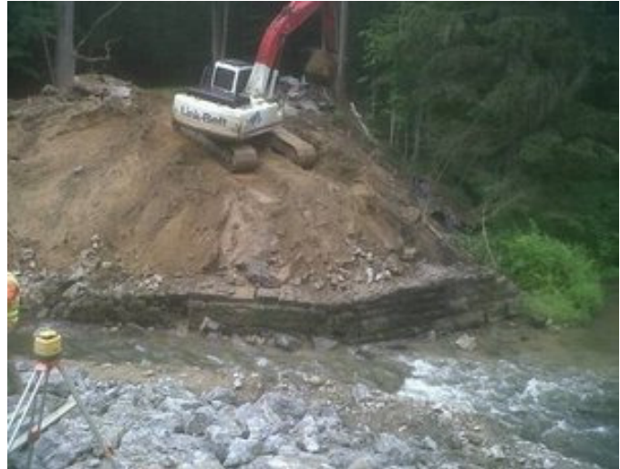
Excavation of the northwest side of Irondequoit Creek.